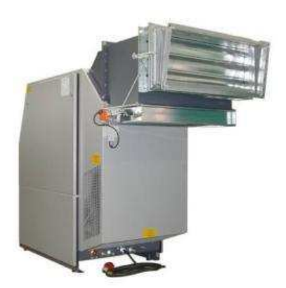
Exhaust air duct with ventilating shutters mounted on a PE-VE