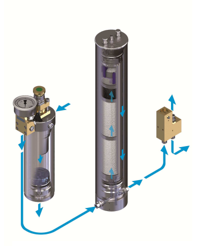
P 61 purification system (picture similar)